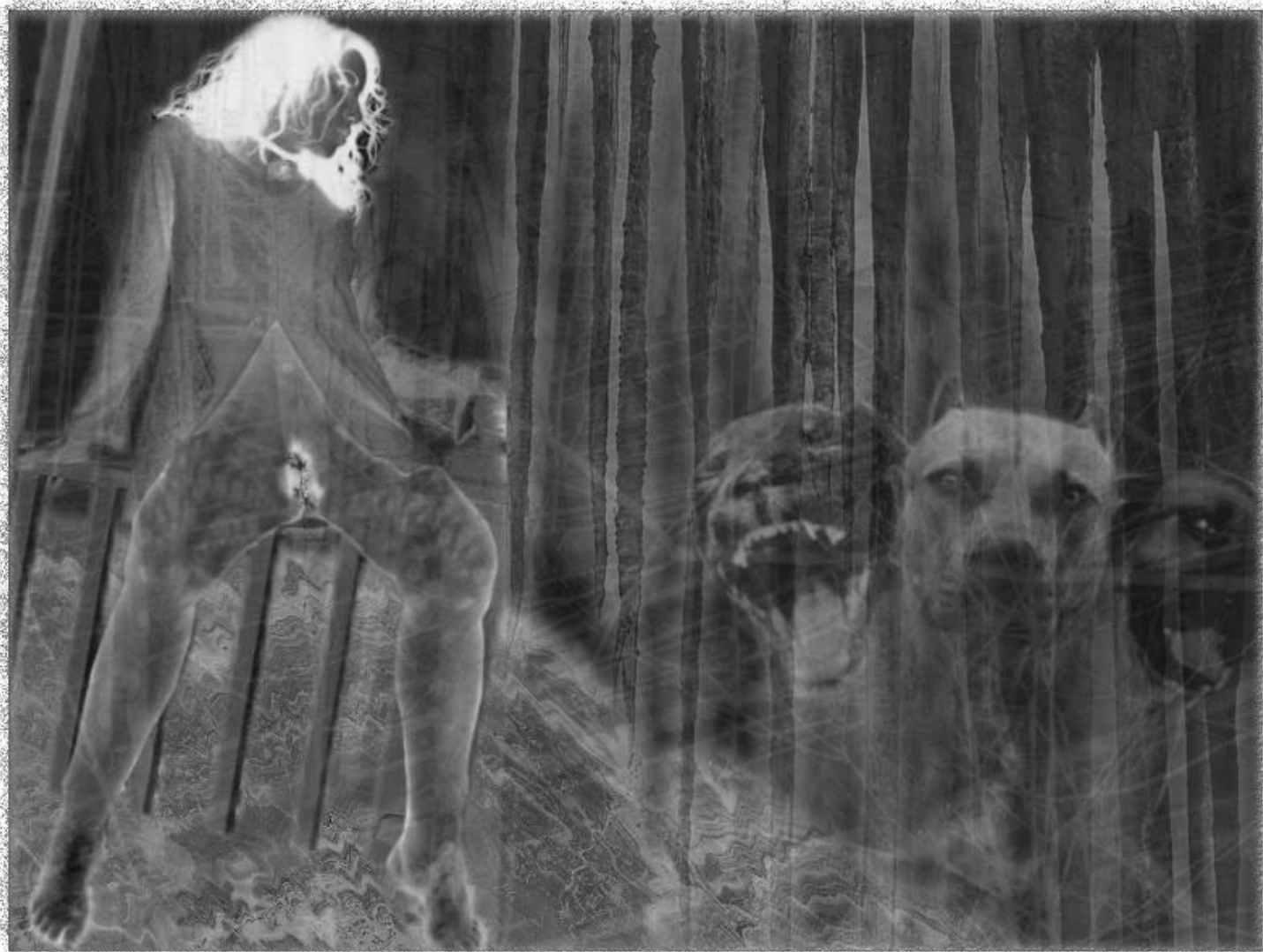
Ti'it Ha-yawen: The Hell of Man's Making

Tartarus is here, the hell of the Greeks, and Sekhet-Aaru, the Egyptian hell, and Mictlan, the Aztec hell. The substance of Ti'it Ha-yawen is constantly remade to reflect new visions of hell; its empty spaces resemble huge structures of gray flesh, lined with puckers—each of these puckers is a human being in purgatory.